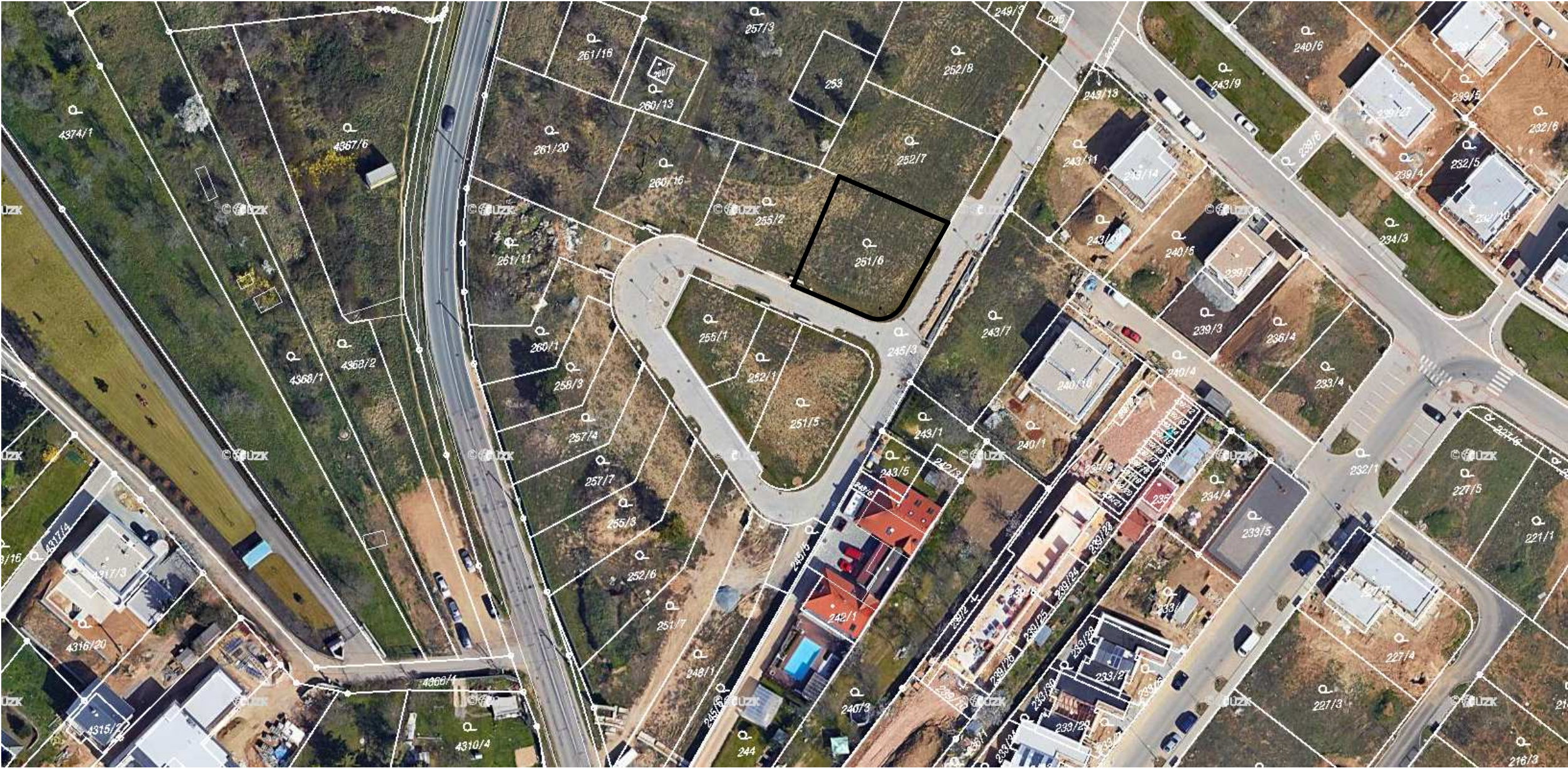
PLACEMENT OF THE PLOT – BRNO KRÁLOVO POLE PARCEL 251/6; SCALE 1:1000